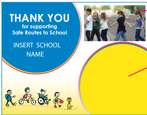
Insert photo here. Be sure to cover template lines.