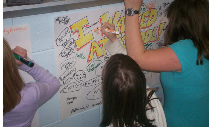
At Dearing Elementary in Dearing, GA students sign a poster touting their Walk AT School accomplishments. The posters were displayed at the school and encouraged other students to get involved!

Park and walk sites are off-campus places (like parks, libraries, and churches) with enough space for kids and adults to congregate and for cars and busses to park or drop-off. These sites enable participation from kids who can't walk or bike from home and reduce traffic congestion near the school, creating a better walking and bicycling environment. For more see WAY TO: Include Students When It's Too Far or Unsafe , available at: saferoutesga.org/Resources/Too_Far_Unsafe.pdf .